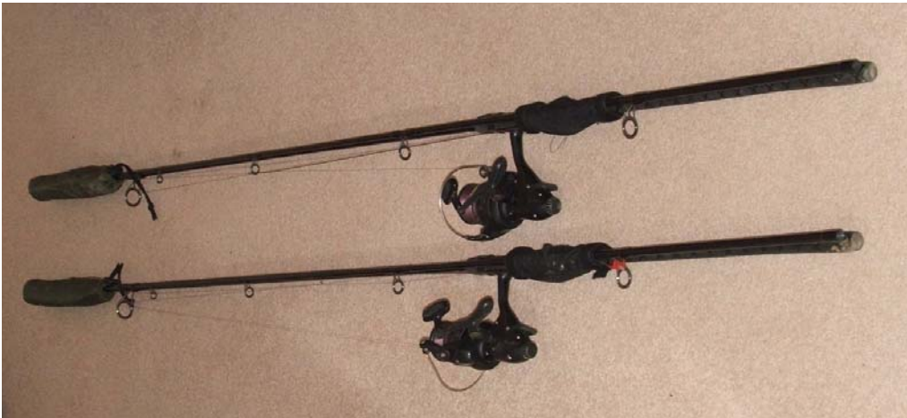
Fox 12' 2.75lb test rods with bait runner reels