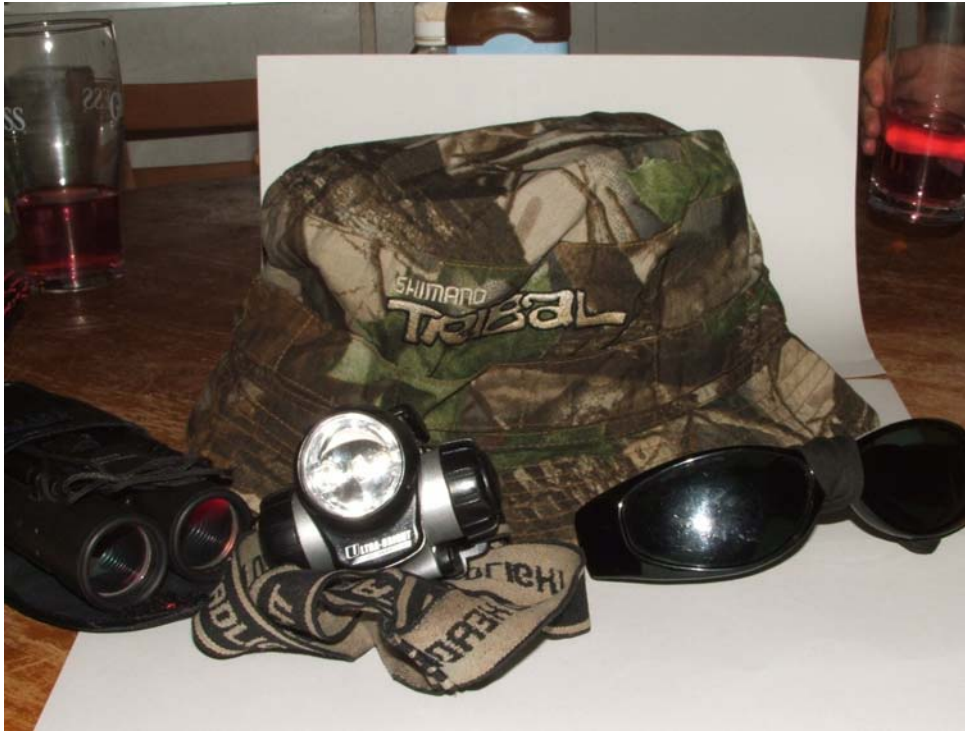
What I consider essential for me to fish effectively