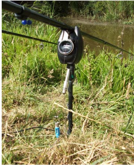
Fox 'm' alarms, bobbin and line clip arrangement