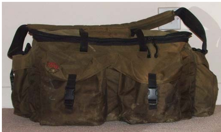
This bag carries absolutely everything I could need for short sessions