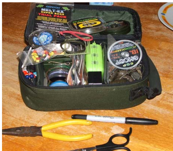
End tackle pouch contains hooks, line, leads etc