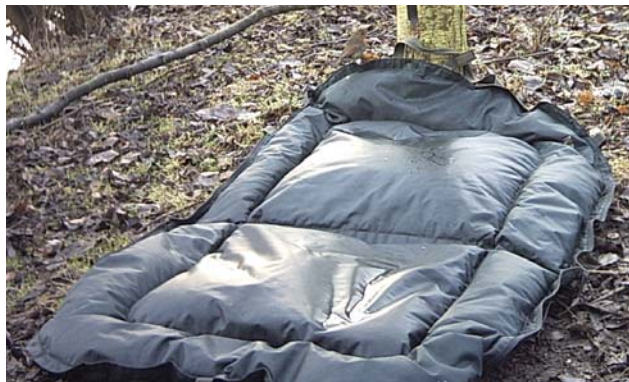
Nash tackle beanie mat