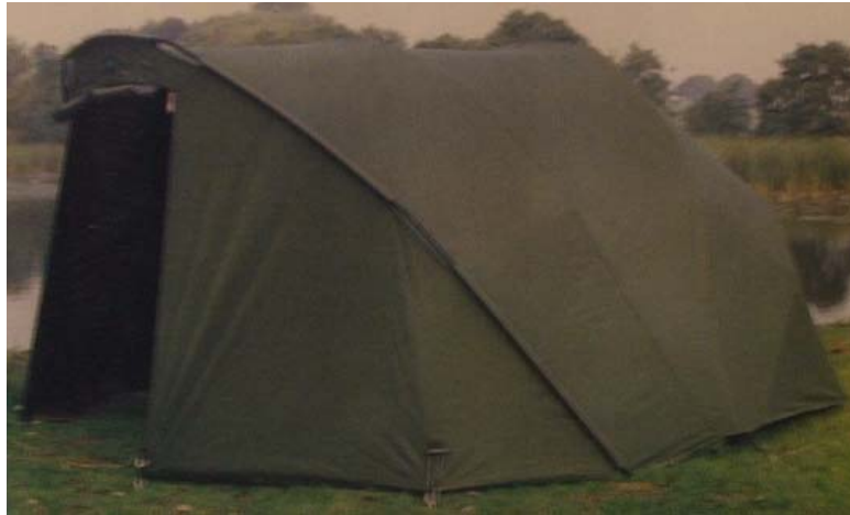
Trakker Armadillo with extended winter wrap