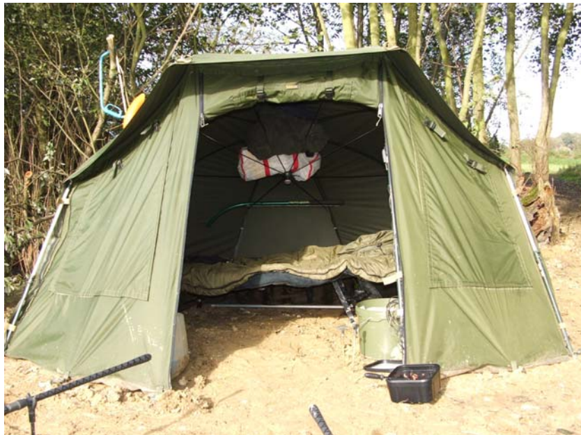
Trakker Big Z 60" oval broly with zip in front panel