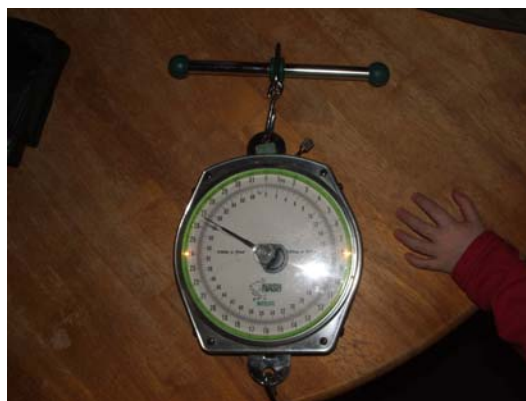
Nash stainless steel nitelite scales