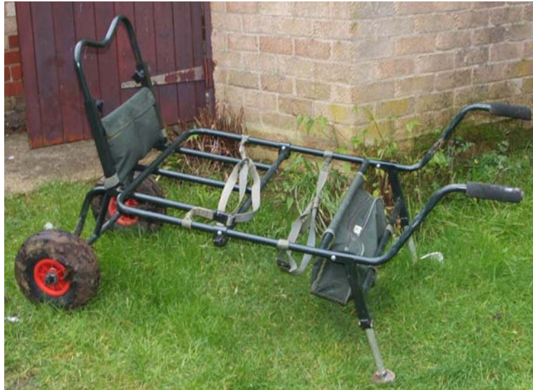
Folding Nash twin wheeled carp barrow

Well that pretty much sums it all up and that is pretty much every thing I would carry when fishing for carp overnight, this is probably the general type of kit you could expect to see on the banks of lakes and rivers the length and breadth of the country, if you choose to try your hand at getting this kit and giving it a bash then I hope my insane rambling has helped in any way.