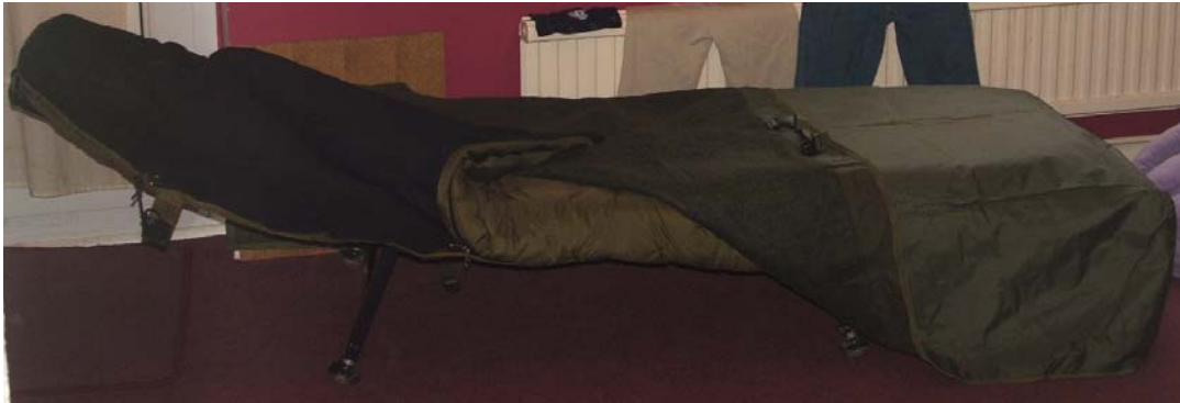
Bedchair set up with sleeping bag and the waterproof cover over the top