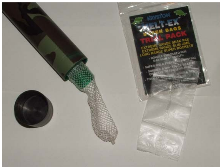
Water soluble pva mesh and pva bags