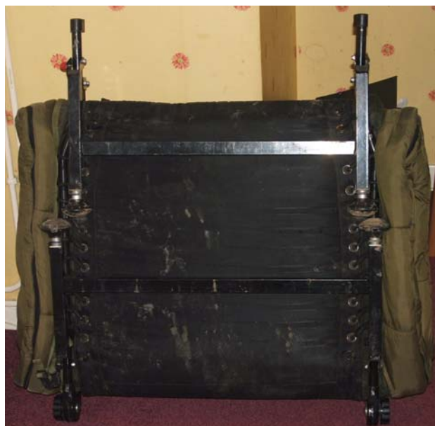
Bedchair folded up with sleeping bag