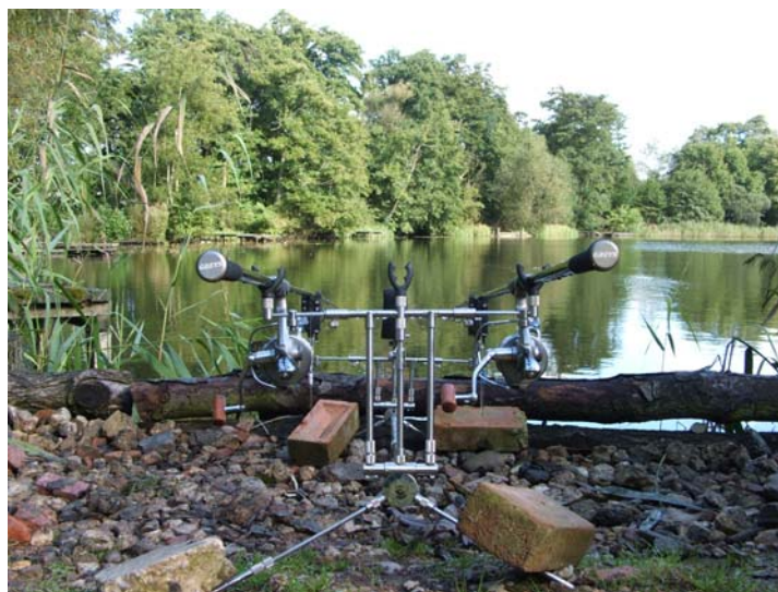
Solar tackle rod pod set up for 3-rods