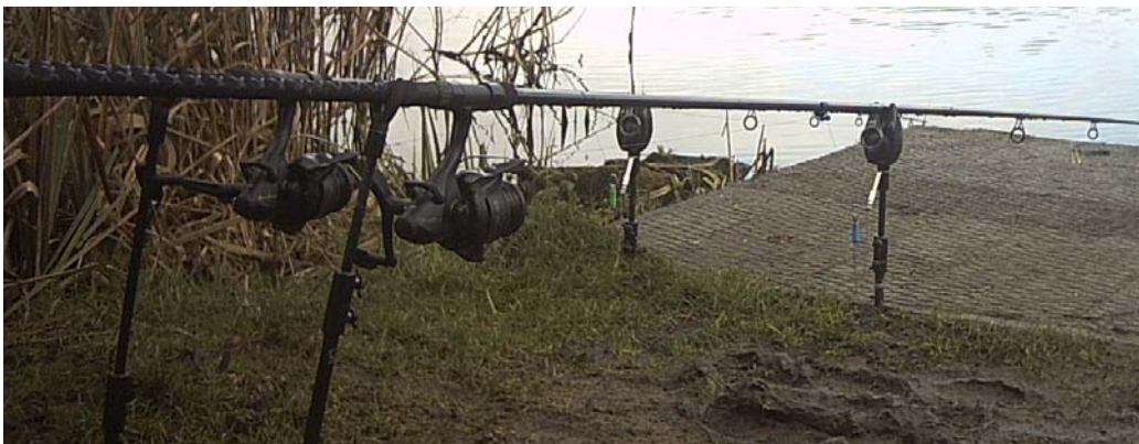
My current single bank stick set up