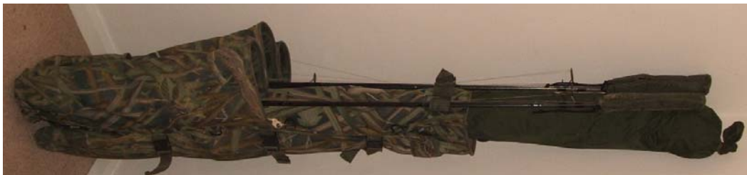
Nash tackle Space Shuttle 5 rod quiver